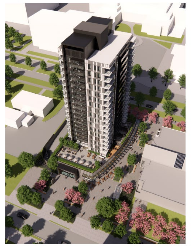
Plaza from above