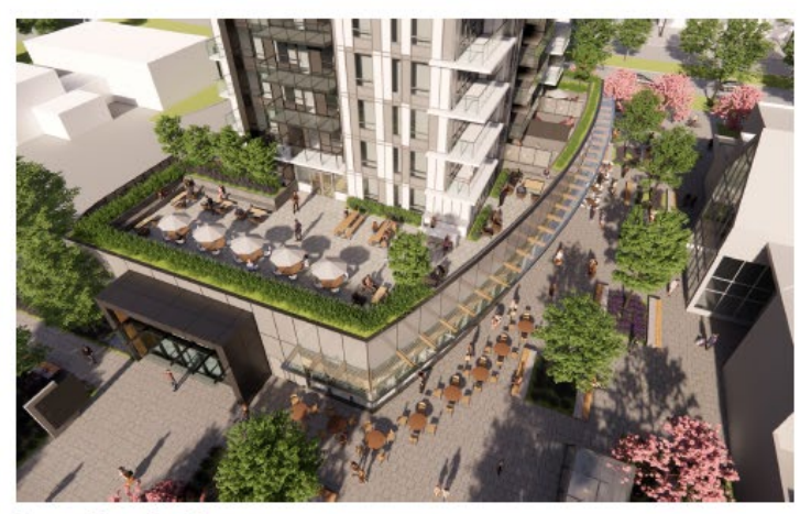
Common Terrace from above